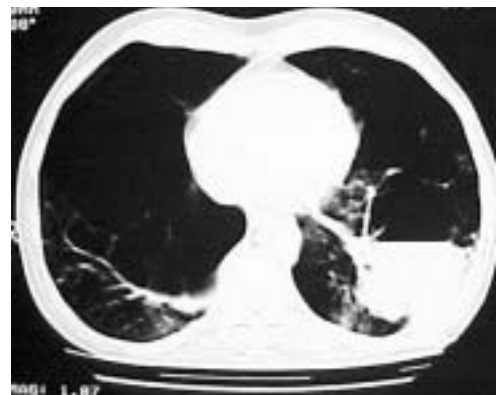
Figure 2 HRCT.