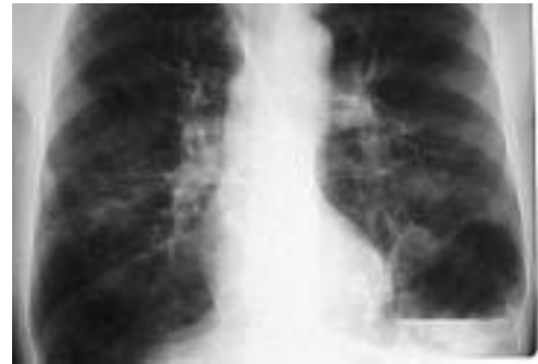
Figure 1 Chest radiography.

During the 4th day of treatment, haemoptysis appeared. A new lesion was noticed on chest radiography (figure 1) and on thoracic high-resolution computerised tomography (HRCT) (figure 2).