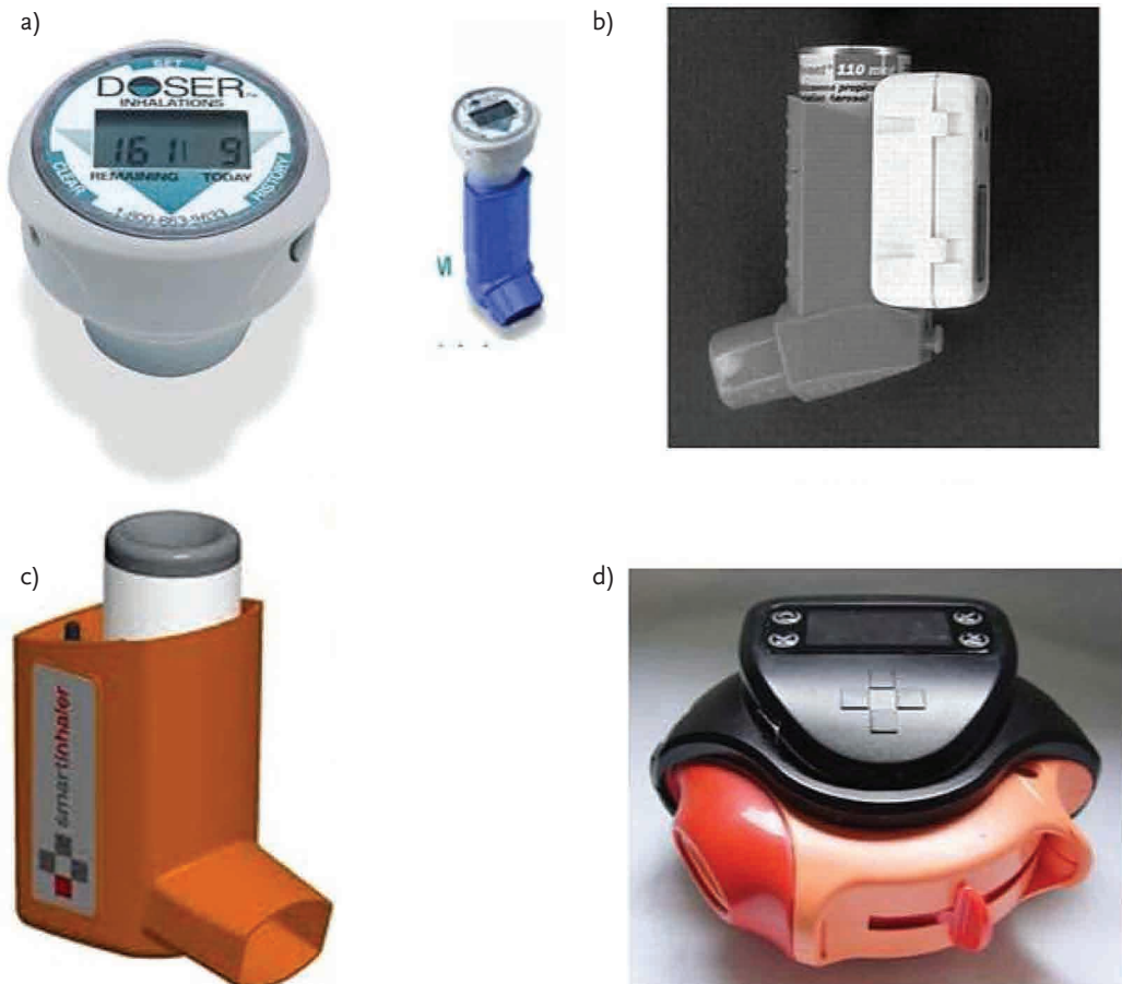
Figure 1 Electronic adherence monitoring devices suitable for use in clinical practice and research. a) Doser, b) MDILog, c) Smartinhaler and d) SmartDisk.

Recent research lends support to a theoretical model that explains differences between