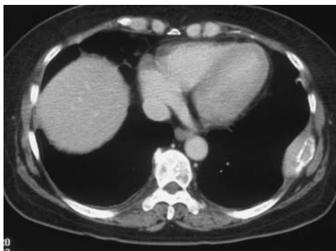
Figure 2 Chest CT scan.