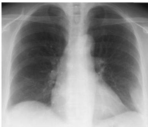
Figure 1 Chest radiograph.

The patient's chest radiograph is shown in figure 1, and the chest computed tomography (CT) scan is shown in figure 2.