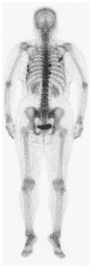
Figure 3 Technetium-99m bone scintigraphy, posterior view.

The results of clinical investigations included: positive urinary protein; erythrocyte sedimentation rate 56 mm per h; immunoglobulin-G 2,720 mg per dL (normal: 870–1,700 mg per dL); and zinc sulphate turbidity test 21.6 U per mL (normal: 0.0–12.0 U per mL). Complete blood cell count and several tumour markers were normal. On technetium-99m bone scintigraphy, several ribs, including the left ninth rib and the vertebrae, showed uptake. The posterior view is shown in figure 3. Abdominal CT and brain magnetic resonance imaging were normal.