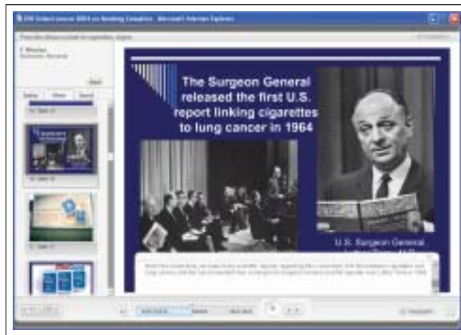
In addition to the standard audio recording of the lecture with synchronised slides, the webcast offers new facilities, such as a transcript of the audio and text search tools.

experiences with their Romanian colleagues. Overall, the course was judged to be extremely useful and successful. The School is looking forward to repeating this course in other countries in the future.