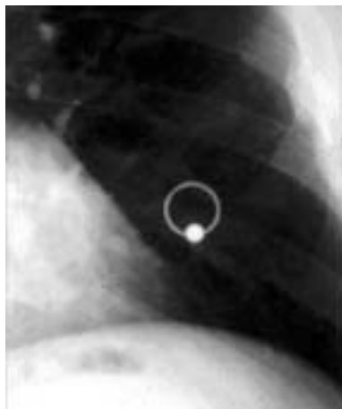
Rib fractures are very difficult to diagnose.

The treatment of CFRD should focus on improving symptoms and prevention of complications. This usually involves treating with insulin, but appropriate dietary advice should also be given. Diet should not be restricted, but insulin should be prescribed to allow adequate energy intake. Sulphonylureas and glitnides may also be used for those with modest elevations in glucose. However, there is very limited evidence to support their use. The dose of insulin may need to be adjusted during pulmonary exacerbations and again this should account for increased energy requirements at these times. People with CF can develop microvascular complications.