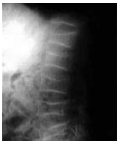
Thoracic cage abnormalities affect respiratory function: lower back vertebrae cross-fractures due to osteoporosis.