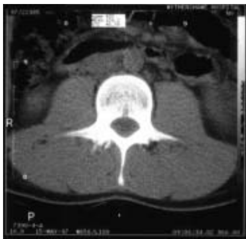
Bone mineral density measured by quantitative computed tomography.

lowest in older patients and those with more severe lung disease. Reduced bone mineral density is particularly important in patients going for lung transplantation, as they are frequently treated with large-dose glucocorticoid therapy, which can cause further loss of bone mass.