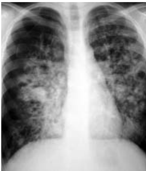
Right-sided pneumothorax in a CF patient with very severe lung disease.

Any pneumothorax should be treated [9]. This usually complicates severe lung disease and carries a high subsequent mortality from respiratory failure as a result of the underlying disease. A high index of suspicion is needed, and a chest radiograph or even a computed tomography scan should be performed if there is unexplained deterioration, breathlessness and pleuritic chest pain. This complication should always be taken seriously in all but the most minor cases. The patient is usually admitted, given intravenous anti-pseudomonal antibiotics and cautious chest physiotherapy is continued. Minor pneumothoraces need not be drained, but larger ones require a chest drain, which may make chest physiotherapy difficult. If there is no rapid re-expansion, surgical consultation should be sought with a view to pleurodesis. A second episode of pneumothorax on the same side is a firm indication for surgery.