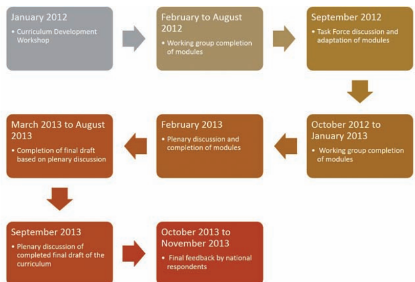
Figure 4 Respiratory Critical Care HERMES curriculum processes.

The pragmatic approach of the paediatric HERMES Task Force on assessments was adopted. Their shortlist of assessment methods in the toolbox was checked by the curriculum participants in terms of its acceptability, applicability and usefulness in the context of each syllabus item and line in the curriculum module. However, for the exercise in respiratory critical care HERMES, simulation was recommended as an assessment tool in many instances such as for invasive mechanical ventilation, extracorporeal