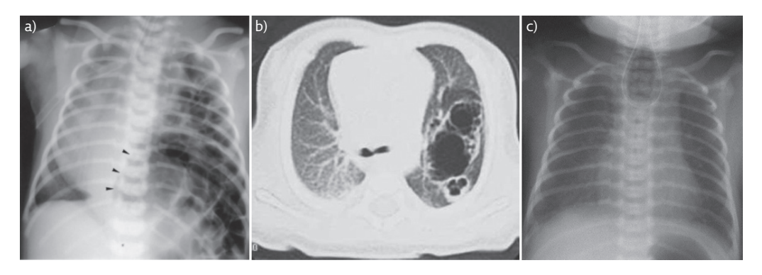
Figure 2 Radiology images of surgical conditions/congenital anomalies. a) Chest radiograph of infant with large left sided CDH. Note presence of bowel and stomach (arrowheads) within the chest. Mediastinal shift to the right. Reproduced from [91] with permission from the publisher. b) CT image of left sided CCAM demonstrating large cystic areas and c) chest radiograph demonstrating coiled nasogastric tube in the upper oesophageal pouch indicating oesophageal atresia. Note gas in stomach indicating presence of fistula between distal oesophagus and trachea. b) and c) reproduced from [21] with permission from the publisher.

Some reports suggest survival rates have shown an improving trend over recent years with in excess of 80% undergoing surgery surviving to discharge [92]; however when all cases are considered, the mortality rate remains between 42-68% [84].