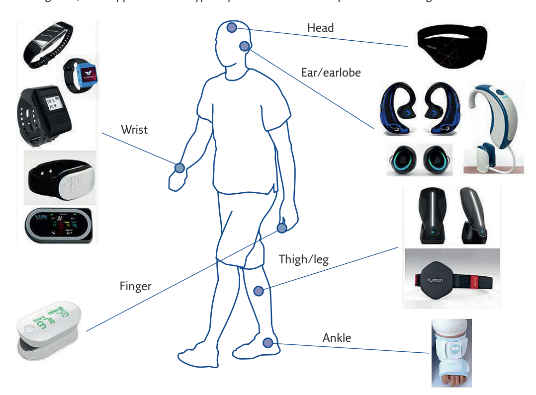
Figure 3 Location on the body of several commercially available wearable devices able to perform pulse oximetry.

Figure 3 shows a schematic diagram of the location on the body of several commercially available wearable devices able to perform pulse oximetry, very often in combination with a set of other measurements. Devices can be worn on the wrist like a watch (e.g. in Oxitone 1000 wrist pulse oximeter, www.oxitone.com; Helo lx, www. helo.life/index enter.html; Vincense whms, www. vincense.com; Gobe activity monitor (combined with blood pressure, respiration rate and body temperature), https://healbe.com; and Visi Mobile (used for fitness and lifestyle applications, estimates calorie consumption by measurements of a pulse oximeter, an accelerometer and a skin impedance sensor), www.soterawireless.com/ visi-mobile). Devices can also be worn on the head, like the Neuroon device (https://neuroon. com/), which is also able to measure electroencephalography, electro-oculography, motion and temperature, and is therefore particularly useful for sleep analysis. A new, interesting trend is to use earphones combining audio features with