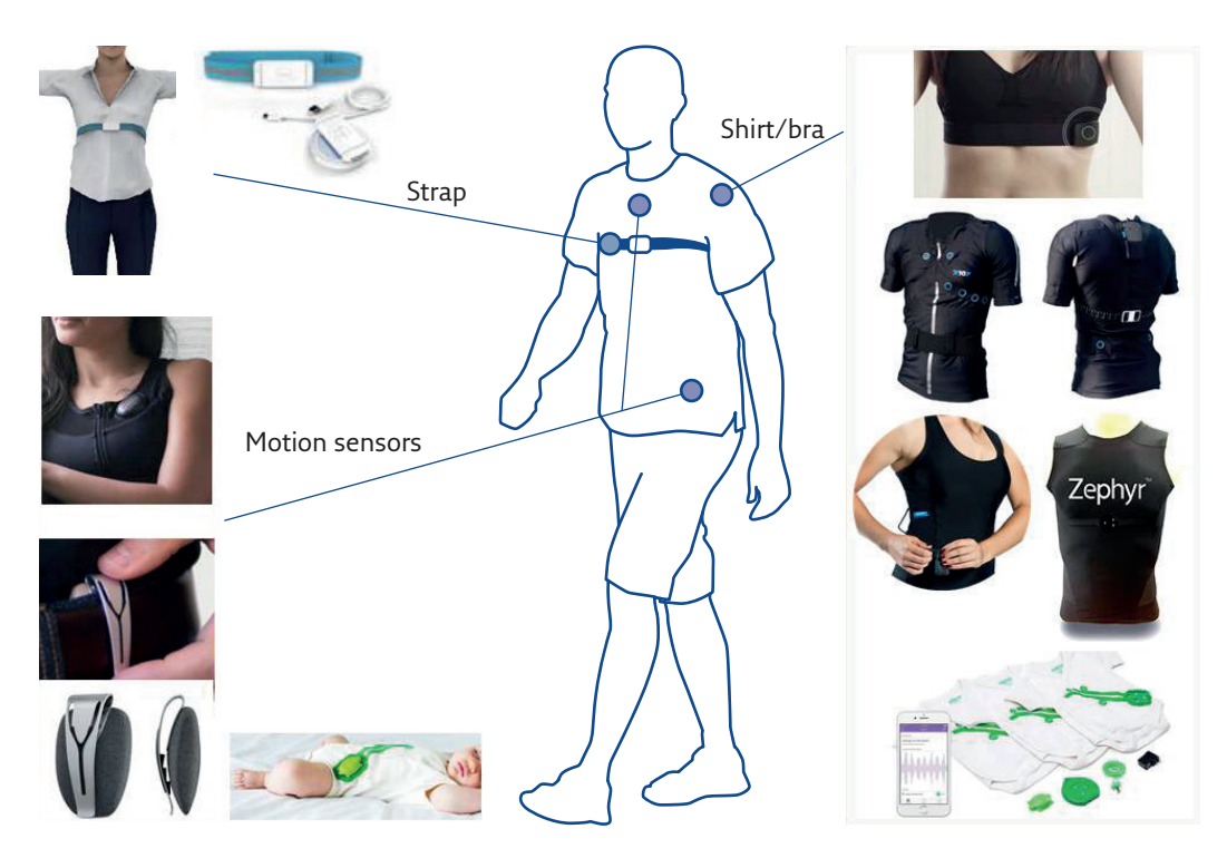
Figure 4 Location on the body of several commercially available wearable devices able to estimate ventilation from chest surface motion.

the anteroposterior axis of the chest. In the past, magnetometers or accelerometers have been used.