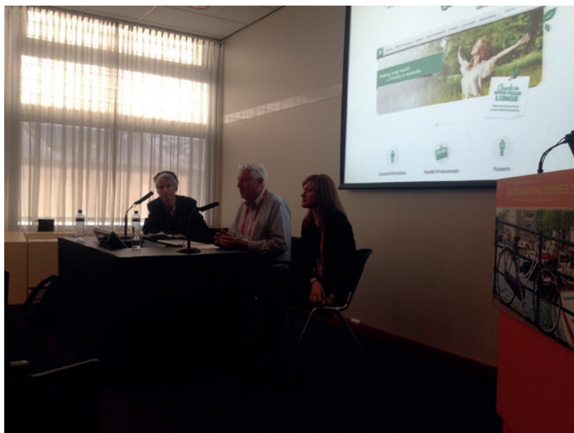
Figure 2 A group of bronchiectasis patients address the EMBARC annual meeting.

There is a significant need for physician education in bronchiectasis, as highlighted by the patient priorities survey, in which one of the top patient priorities was that their primary care physician should have greater knowledge and understanding of their condition [11]. Patients have been integral to the development of a physician education platform that is due for launch in 2017. In addition, patients consistently report a lack of high-quality educational material available for them to understand their own condition. Patients have therefore led the development of a patient education website to be launched by ELF in 2017 to provide high-quality