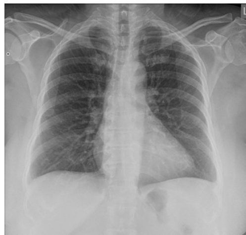
Figure 4 Chest radiograph showing resolution of the right-sided pleural effusion. Minimal blunting of costophrenic angles are seen on both sides. Ultrasound of the thorax showed no pleural effusion or thickening on both sides.

malignant effusions in around two-thirds of cases [10]. Addition of the cell block technique to fluid cytological analysis augments the diagnostic yield of malignant pleural effusion [11]. The routine use of CT of the thorax in evaluation of pleural effusion is futile and only ends up in increasing the cost of managing such patients [12]. If a CT chest is required, it should be done after aspirating the pleural fluid so that the underlying lung parenchyma can be easily visualised. This is useful in moderate to large pleural effusions. Contrast infusion protocols should be modified in these patients so that the pleural surfaces are seen better [13]. A CT pulmonary angiogram should be performed in cases where pulmonary embolism is suspected as almost half of these cases are found to have pleural effusion [14]. Pleural fluid tumour markers may have a role in diagnosis of malignant pleural effusions where the cytology is negative and there is a high pretest probability of malignancy [15]. Pleural fluid ADA has a good diagnostic accuracy for tubercular pleural effusions in high prevalence areas [16]. Closed pleural biopsy is the next step in the evaluation of aetiology of pleural effusion when the clinical features and pleural fluid analysis have been inconclusive. Addition of image guidance increases the yield of the procedure. It is easy,