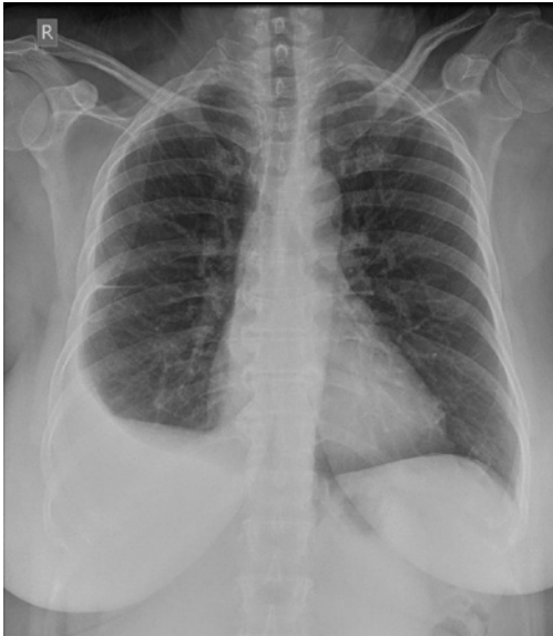
Figure 1 Chest radiograph showing mild right-sided pleural effusion, no mediastinal shift and normal lung parenchyma.

Sputum, urine and blood cultures were sterile. Serological tests for common respiratory bacteria and viruses were negative.