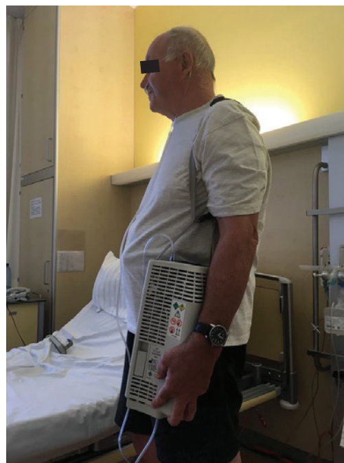
Figure 3 Patient with a nasal cannula and liquid oxygen tank.

Patients using liquid oxygen are more apt to venture outside the home and use daily oxygen for longer periods compared with their counterparts using