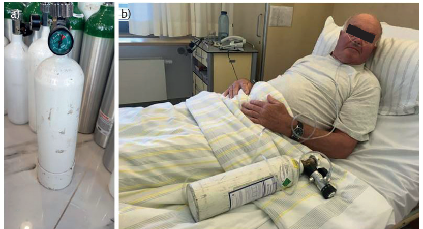
Figure 2 a) Compressed gas cylinder with an attached flowmeter, and b) a patient receiving oxygen from this device.

A randomised multi-arm repeated-measures prospective study compared the use of liquid oxygen, home fill cylinder, portable concentrator and lightweight cylinder in 39 patients with stable severe COPD. There were no differences