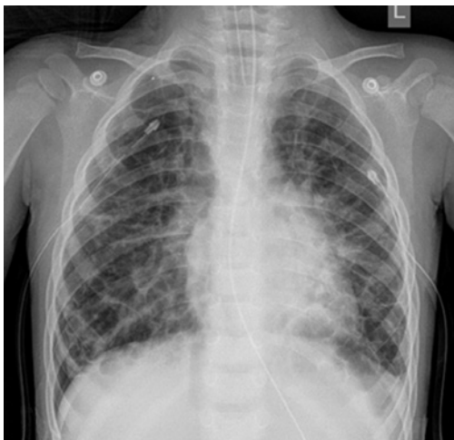
Figure 1 Chest radiograph of a patient with pPLCH. An endotracheal tube and bilateral intercostal chest drains are in situ with a residual right-sided pneumothorax. Extensive cystic changes and abnormal linear interstitial opacification can be seen.

PLCH is a rare disease with heterogeneous presentation, which can make diagnosis challenging. Diagnosis should be based on histological and immunophenotypic examination of