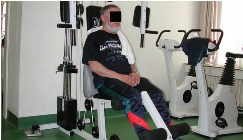
Figure 1 Resistance muscle training for lower limbs in a patient with COPD.

cardiopulmonary system, and this is achieved by shortening exercise duration and/or reducing active muscle mass. Indeed, interval training and resistance muscle training (figure 1) are appropriate and effective alternatives to endurance exercise training [5, 6]. Recently, neuromuscular stimulation of lower limb muscles in patients with severe COPD who were unable to participate in a regular exercise training programme was shown to improve muscle strength, exercise performance and quality of life [7].