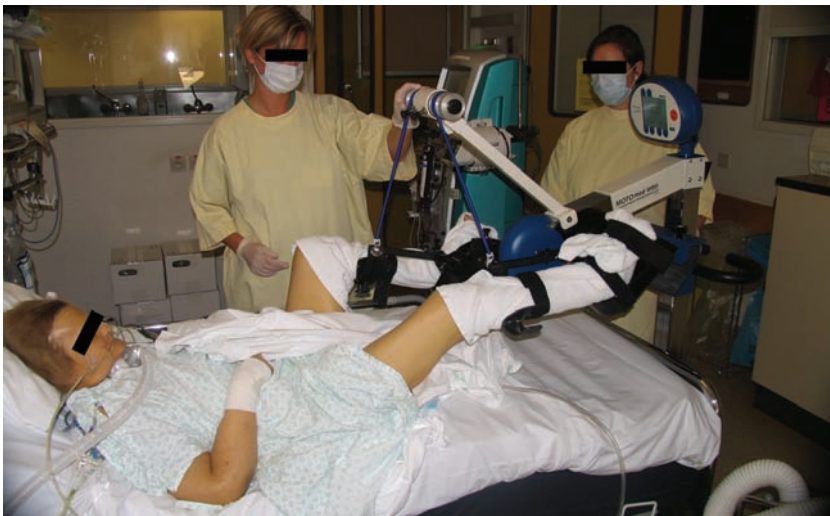
Figure 2 Device for active and passive cycling in a bed-ridden patient in the ICU (Motomed Letto; RECK, Betzenweiler, Germany).

muscle fibre atrophy and protein loss [9]. In addition, electrical stimulation of the quadriceps (figure 3), with active limb mobilisation, enhances muscle strength and decreases the number of days needed to transfer a patient from bed to chair [10]. Recent studies also underpin the need for exercise training after a period of critical illness to enhance functional capacity [11].