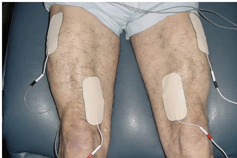
Figure 3 Neuromuscular stimulation of the quadriceps femoris muscles.

In conclusion, pursed-lips breathing has been found to be effective in improving gas exchange, and reducing hyperinflation and dyspnoea. COPD patients who do not spontaneously adopt pursed-lips breathing show variable responses. Those patients with loss of elastic recoil pressure seem to benefit more from practicing this technique during exertion and episodes of dyspnoea.