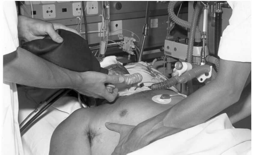
Figure 7 Manual hyperinflation and chest wall compression in a ventilated patient.

Post-operative pulmonary complications after thoracic and abdominal surgery remain a major cause of morbidity and mortality. Prolonged hospitalisation and ICU stay may result. Early mobilisation is very effective in the