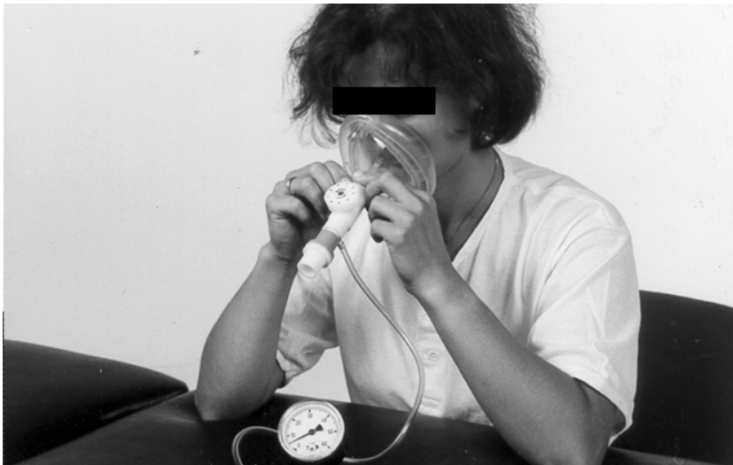
Figure 6 Breathing exercises with positive expiratory pressure mask in a patient with cystic fibrosis.

The concept of therapeutic forced expiratory manoeuvres is to enhance mucus transport due to the interaction and energy transfer between the high airflow velocity and the mucus layer (two-phase gas-liquid interaction). Huffing and coughing and, also, though to a lesser extent, ventilation at rest or during exercise induce higher airflow velocities that, equally effectively, stimulate mucus transport from central and intermediate lung zones [27]. However, in patients with airway instability (pulmonary emphysema), forced expiratory manoeuvres may result in airway collapse and impairment of mucus transport. Indeed, manual chest wall compression during forced expiration has been shown to decrease peak cough flow rate in patients with severe COPD [28]. In contrast, in NMD, reduced expiratory muscle strength limits effective huffing and coughing. Manual assistance with chest wall compression enhances peak cough flow rate in patients with NMD without scoliosis, but was not shown to be beneficial in patients with chest wall deformities [28]. In addition, deep inspiration increases maximum insufflation capacity and peak cough flow in patients with progressive NMD [28]. Mechanical insufflation and exsufflation, and manually assisted coughing are effective and safe to facilitate clearance of airway secretions [29]. Glossopharyngeal breathing has been shown to increase vital capacity and expiratory flow rates, and is a treatment option in patients with high spinal cord injury.