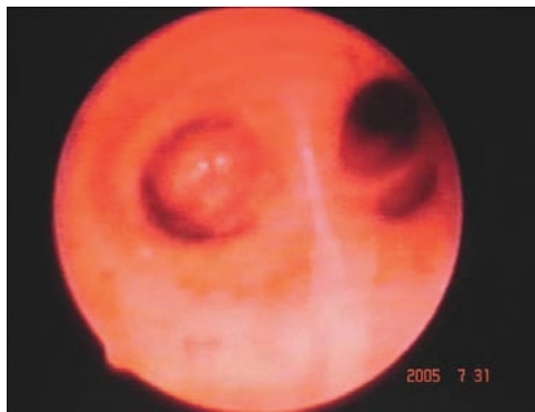
Figure 2 Picture taken during flexible bronchoscopy, showing a shiny, vascularised tumour.

Based on the results of the CT, it was decided to perform a flexible bronchoscopy (figure 2). Bronchoscopy revealed a pink-coloured mass with a long pedicle connected to the internal wall of the left principal bronchus. The mass moved up and down as the patient breathed and its surface was smooth. Histology of the mass is shown in figure 3.