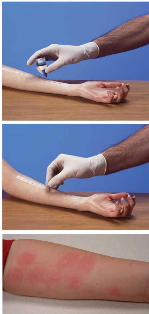
Figure 1. Skin-prick test.

Only when these three conditions are met will atopic disease become discernible. This has important implications for allergy testing. On the one hand, there will be sensitised individuals who do not develop symptoms because they are not (sufficiently) exposed to the allergen under study, or because they fail to exhibit end-organ responsiveness. These individuals will be sensitised asymptotically. On the other hand, studies have shown that quite a significant number of individuals with atopic disease, such as asthma, eczema or rhinitis, do not show sensitisation to specific allergens. It appears, therefore, that routine allergy testing can yield both false-positive and false-negative results. Most importantly, it is imperative that physicians realise that a positive allergy test does not prove allergy – it merely shows sensitisation. As a result, the term allergy test should be avoided and it should be replaced with the term sensitisation test.