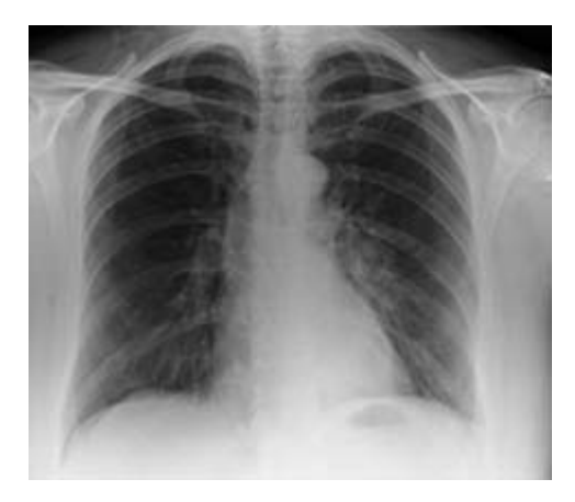
Figure 1 Chest radiograph

A 40-yrold female was seen in the rapid-access chest clinic with a 4-month history of dry cough, mild dyspnoea and left chest discomfort, which seemed to have started during a holiday to a sunny European country. Antibiotics given by her primary care physician had not helped. The patient was an ex-smoker (10 pack-yrs, having given up 14 yrs previously). There were no significant comorbidities A chest radiograph (CXR) was performed (fig. 1).