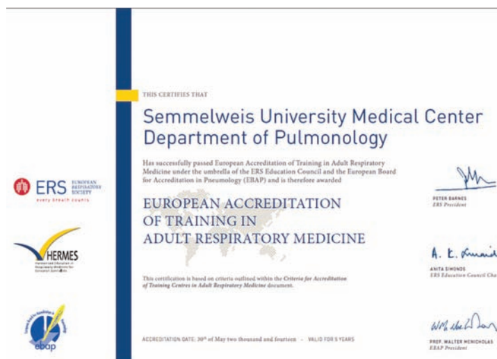
Figure 3 Accreditation of Training Centre Certificate.

Based on the recommendations by the review team, the Accreditation Committee will decide